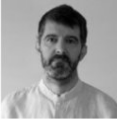
Mikel Iñaki Landa Esparza