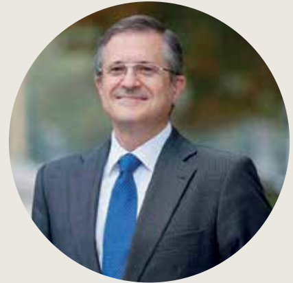
PROF. JOSÉ LUIS DE LA CUESTA

Despite the calls for interdisciplinarity in victimological science and practice, the criminal justice system continues to be fragmented in many ways. Even if the Directive 2012/29/EU of the European Parliament and of the Council of 25 October 2012 establishing minimum standards on the rights, support and protection of victims of crime, in line with the UN international standards on victims' rights, demands integral protection for victims and inter-professional coordination, the reality in many jurisdictions is that many victims keep being seen as instrumental in the criminal process causing them further secondary victimization, as the 2019 EU Fundamental Rights Agency study on victims of violent crimes has recently underlined. At the same time, there is a risk of converting the victims in pathological objects for psychological intervention by concentrating on individual victims without considering broader social and justice aspects. Concrete proposals to achieve a better collaboration among jurists and psychologists, as well as other professionals, will be discussed in order to approach a more holistic understanding of the processes of victimization and recovery, including the consideration of digital advancements.