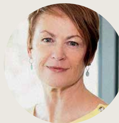
PROF. ROBYN HOLDER

The abstract public status of the 'ideal victim' has been sketched as someone weak, who is carrying out a respectable project and who is not to be blamed (Christie, 1986). This image has evolved as a portrayal of vulnerability. Clearly, individuals and groups within societies are vulnerable in different ways to crime, violence and exploitation, and to different types and forms of violation, bias and discrimination. An emphasis on vulnerability as the categorising device defining which victims receive state assistance and societal support has strengthened. In this presentation, I trace the different conceptualisations of vulnerability, the ways in which it is used, and examine some important changes in criminal justice responses to 'vulnerable victims'. However, I observe that the power to define who or what is 'vulnerable' is characterised by a narrowing of resourcing and recognition. Indeed, over the past 10-20 years, policy and legislative reform on victims' rights in criminal justice have drifted from recognition of universal entitlements to specific offerings to 'vulnerable' groups. I develop Christie's location of policy debates in victims' 'public status' to argue an alternative understanding of victims as being in a political relation to state institutions. They are citizens first whose rights and responsibilities are mutually constitutive of the state's obligations and duties to its citizens.